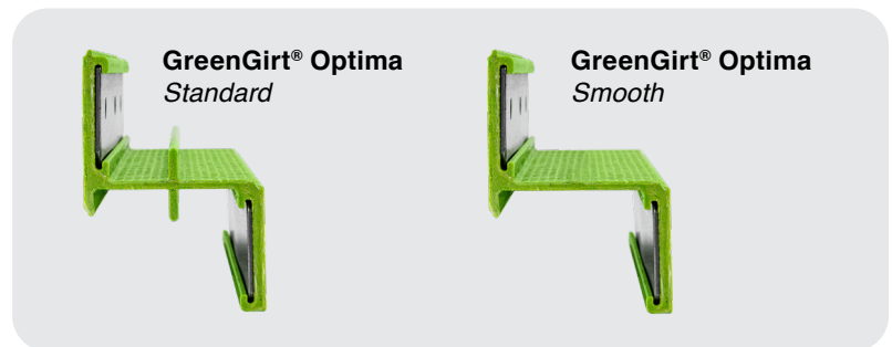
GreenGirt® Optima Standard